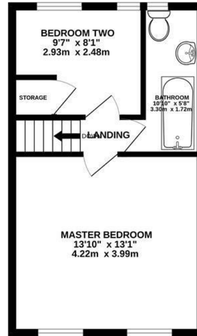
1ST FLOOR 331 sq.ft. (30.8 sq.m.) approx.